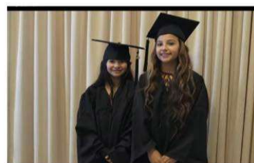
RTransform 2023, Sheffield