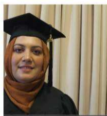
rm 2023, Sheffield