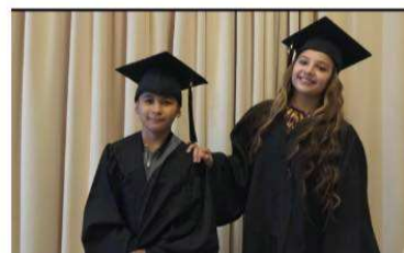
RTransform 2023, Sheffield