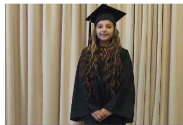
Transform 2023, Sheffield